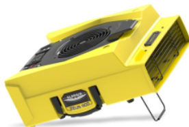
▲ Stand (Stairwells/Wall Drying)