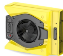
▲ Right(Wall Drying)