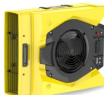
▲ Left (Wall Drying)