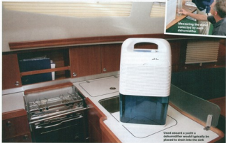
Used aboard a yacht a dehumidifier would typically be placed to drain into the sink

O ver the winter lay up season thoughts invariably turn to how best to preserve your boat when she is out of the water. Mould is a major enemy, and it loves the moist, stale air found below decks in a yacht shut up for winter. Air can be prevented from going stale by good ventilation (see PBO July 2007 for a test of 10 ventilators), but moisture can need some extra help to keep it at bay. On a damp day the air entering the boat through the ventilators will be moist, and the moisture can then condense on cool surfaces.